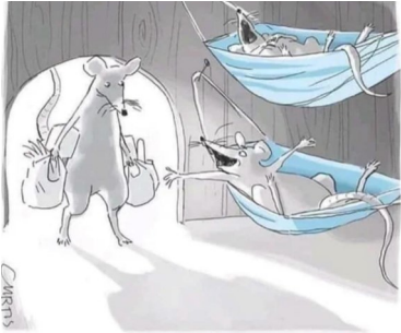
"FREE HAMMOCKS, all over town. It's like a miracle!"